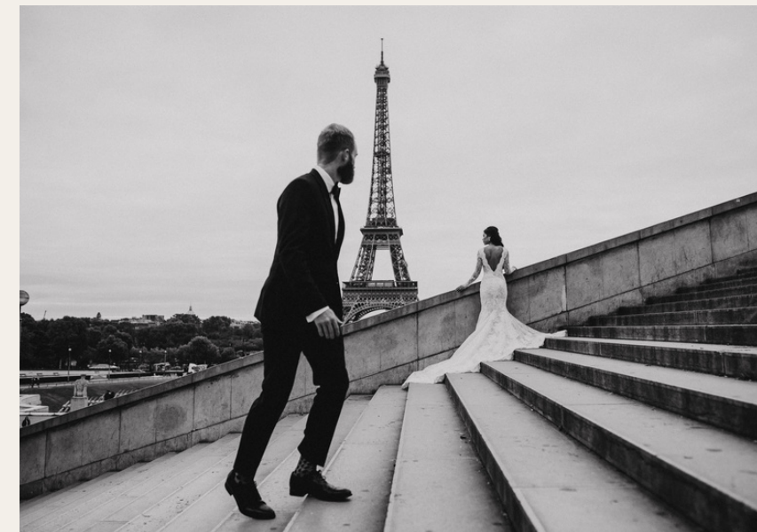
ALBUM 12X12 IN / 14 SPREADS INCLUDED $2475