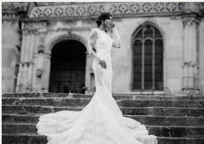
24X36 INCH GALLERY WRAP CANVAS $800