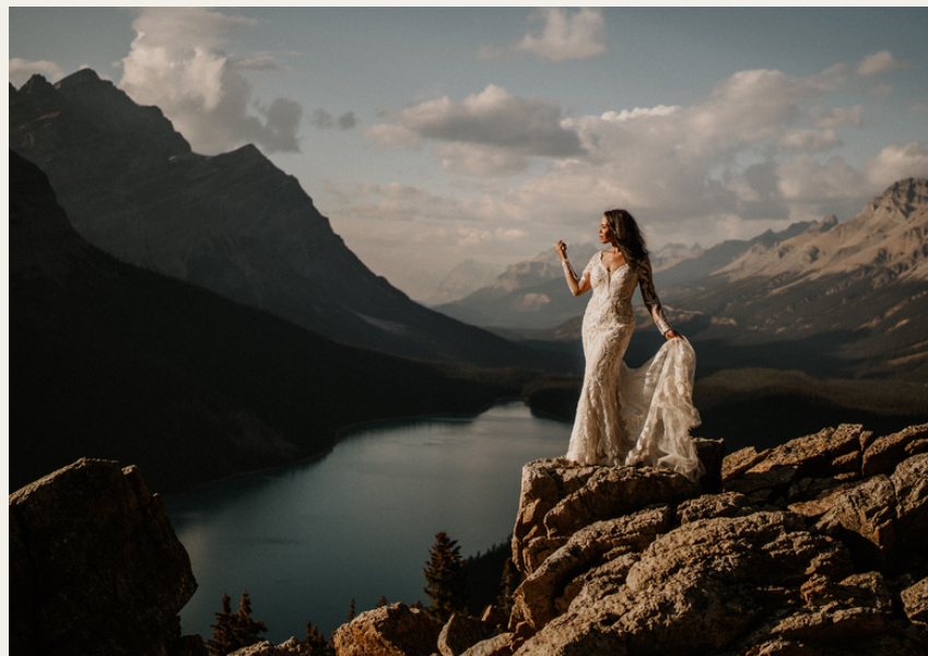
ALBUM 10X10 IN/ 14 SPREADS INCLUDED $1975

I have partnered with the finest printers and luxury albums designers in North America. We can create stunning albums and wall art for any space.