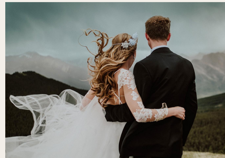
ACRYLIC/ALUMINUM WALL ART from $1000